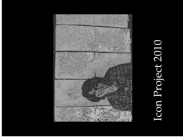
Icon Project 2010